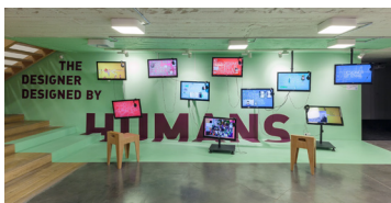
3rd Istanbul Design Biennial 2016 (Turkey), 22 Oct – 04 Dec 2016