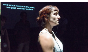
Festival TNT – Terrassa Noves Tendències 2016. CAET – Centre d'Arts Escèniques de Terrassa, 29 Sep – 02 Oct 2016