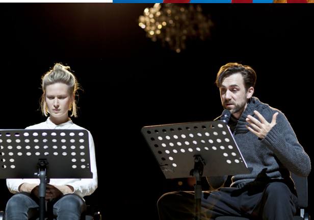
Spanish Contemporary Theater Sessions in Poland 2016, TR Warszawa (Poland), 07 – 08 Nov 2016