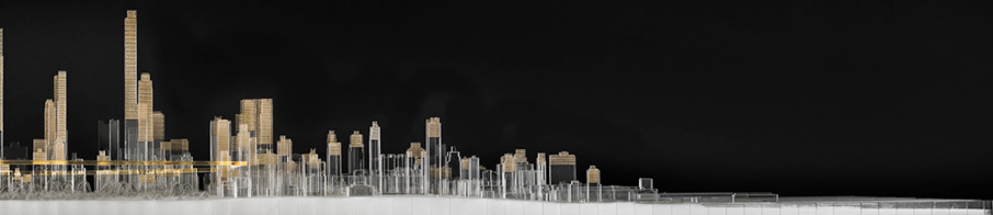
La hija del aire by Calderón de la Barca. Teatro Julio Jiménez Rueda de México (Mexico City), 15 Apr – 16 Jul 2017