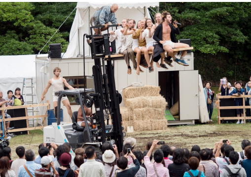
Alchi Triennale 2016 Rainbow Caravan (Japan), 11 Ago - 23 Oct 2016