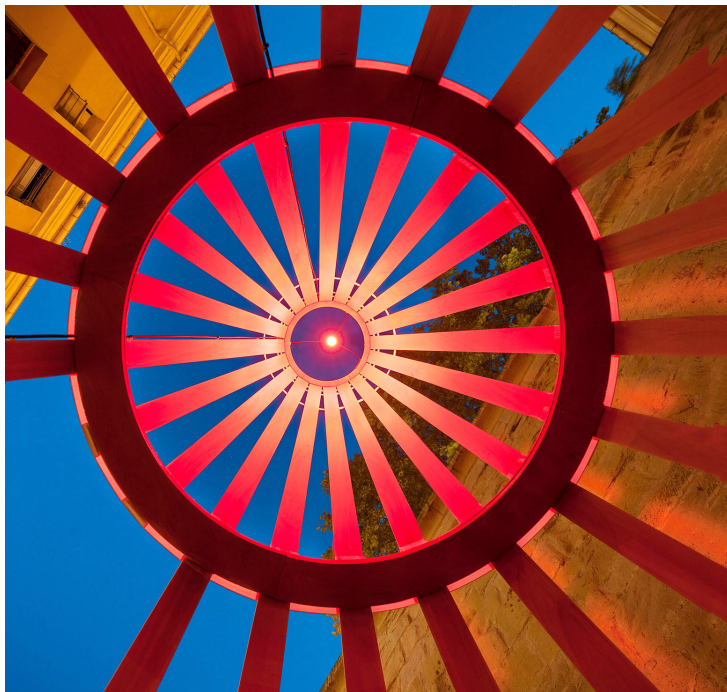
Concéntrico 2017. Logroño's Architecture and Design Festival (Logroño), 27 Apr – 01 May 2017