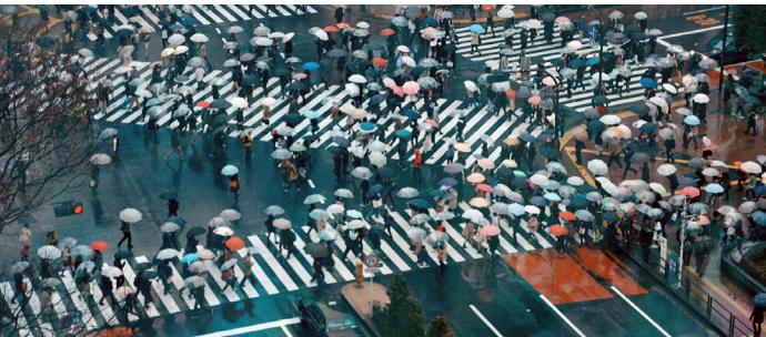
Delicate Balance (Guillermo García López). Edinburgh International Film Festival, 21 Jun 2017 – 02 Jul 2017

Festival TNT – Terrassa Noves Tendències 2016, CAET – Centre d'Arts Escèniques de Terrassa, 29 Sep – 02 Oct 2016