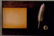
3 La literatura hecha vida 3