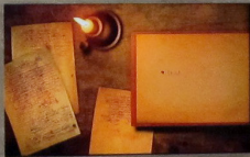
3 Miguel de Cervantes 3