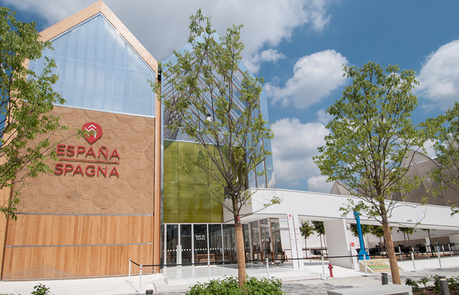
Spain Pavilion at Expo Milano 2015, May – Oct 2015