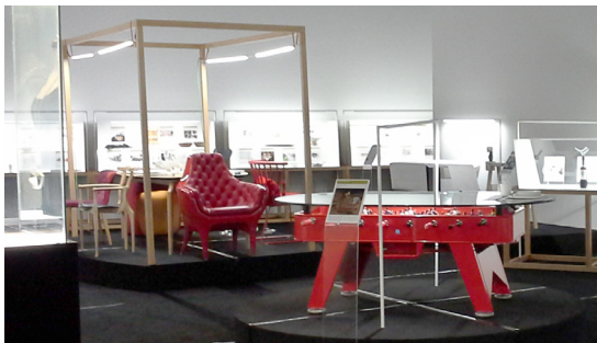
Tapas. Spanish Design for Food. Centro del Carme (Valencia), Oct 2016 – Mar 2017