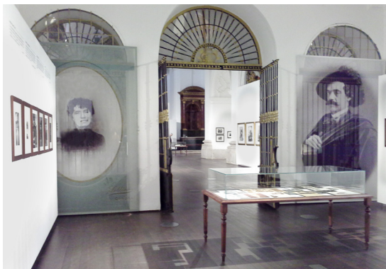
The Face of Literature. Sala municipal de exposiciones de las Francésas (Valladolid), Jan – Feb 2017

We produce exhibitions, shows, publications, audio-visual projections, concerts, presentations and other activities related to a broad range of cultural initiatives of our own or in collaboration with other organisations, both national and foreign. These activities can be complemented by side events such as workshops, interactive forums, meetings, etc. We pay special attention to the impact of the Internet and the incorporation of new technologies in the cultural sector, publishing a Digital Culture annual report.