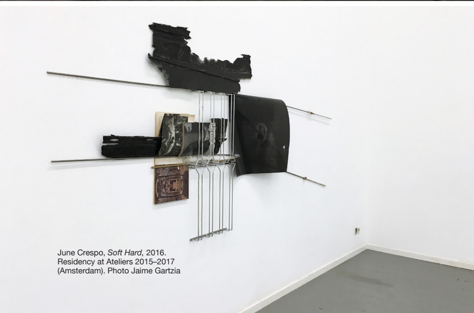
June Crespo, Soft Hard , 2016. Residency at Ateliers 2015–2017 (Amsterdam).