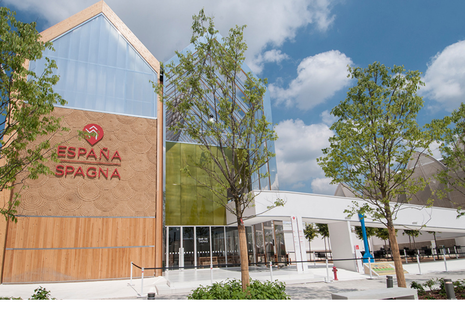
Spain Pavilion at Expo Milano 2015, May – Oct 2015